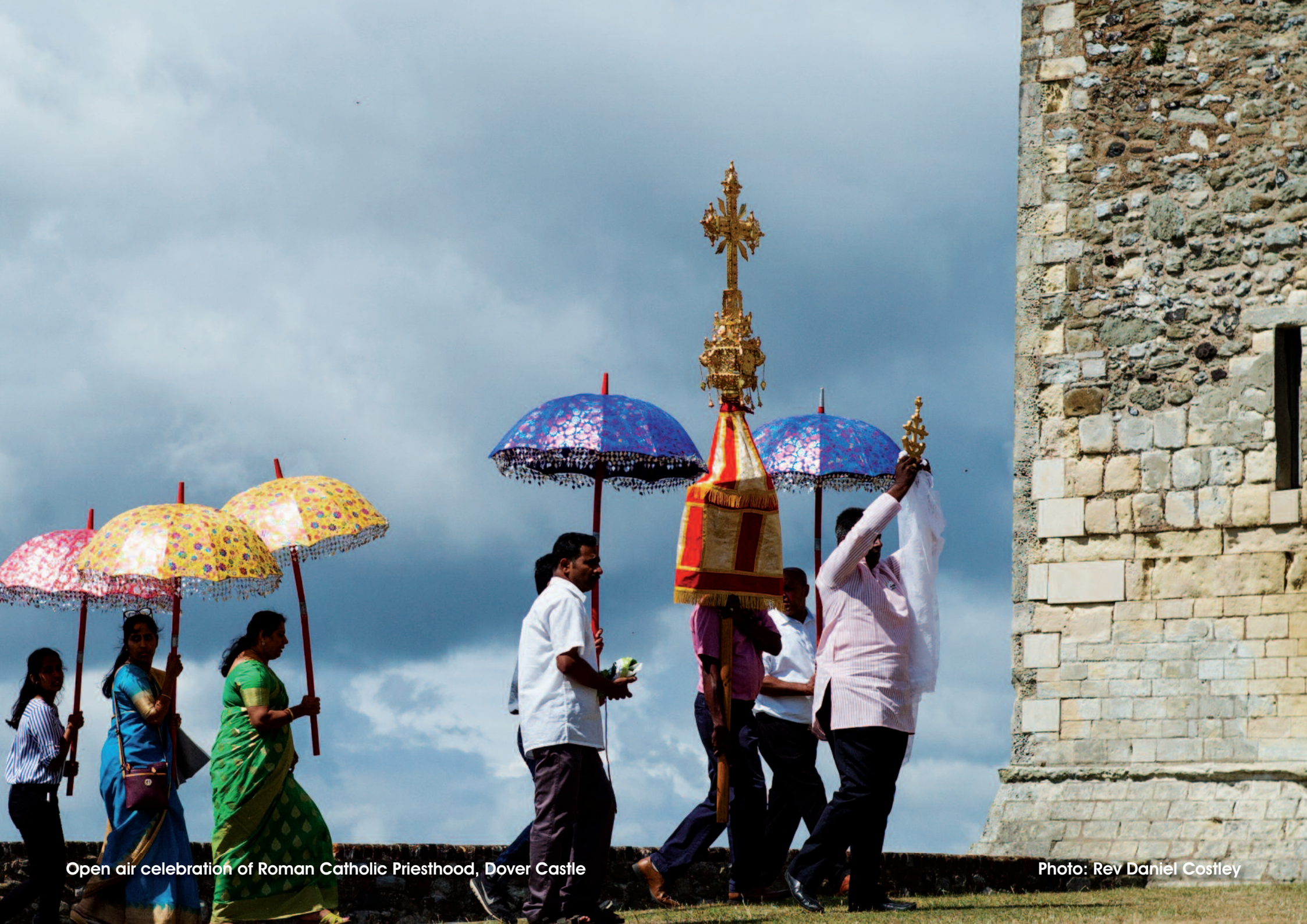
Open air celebration of Roman Catholic Priesthood, Dover Castle