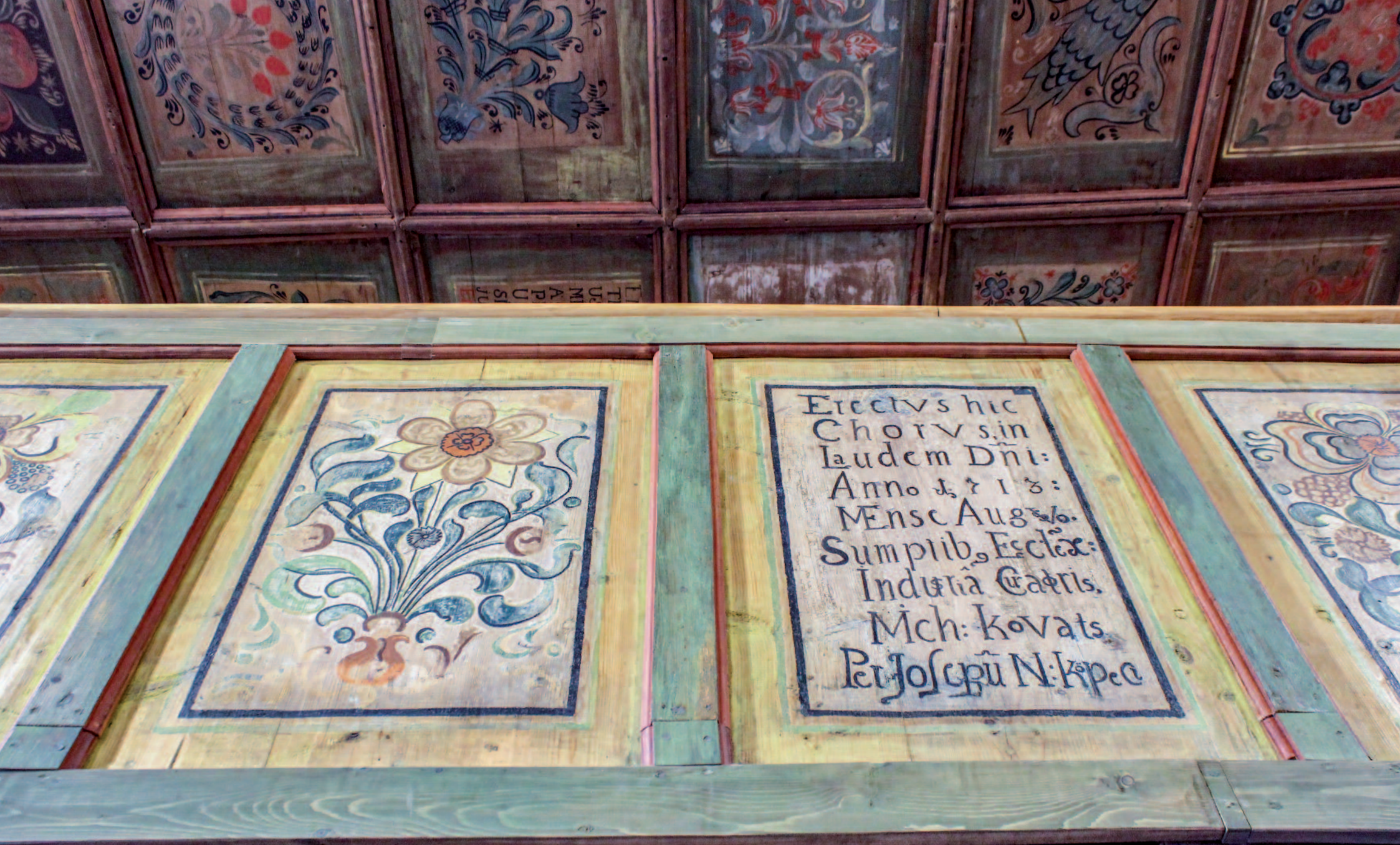
The interior of the Unitarian Church, Oklánd, Transylvania, Romania