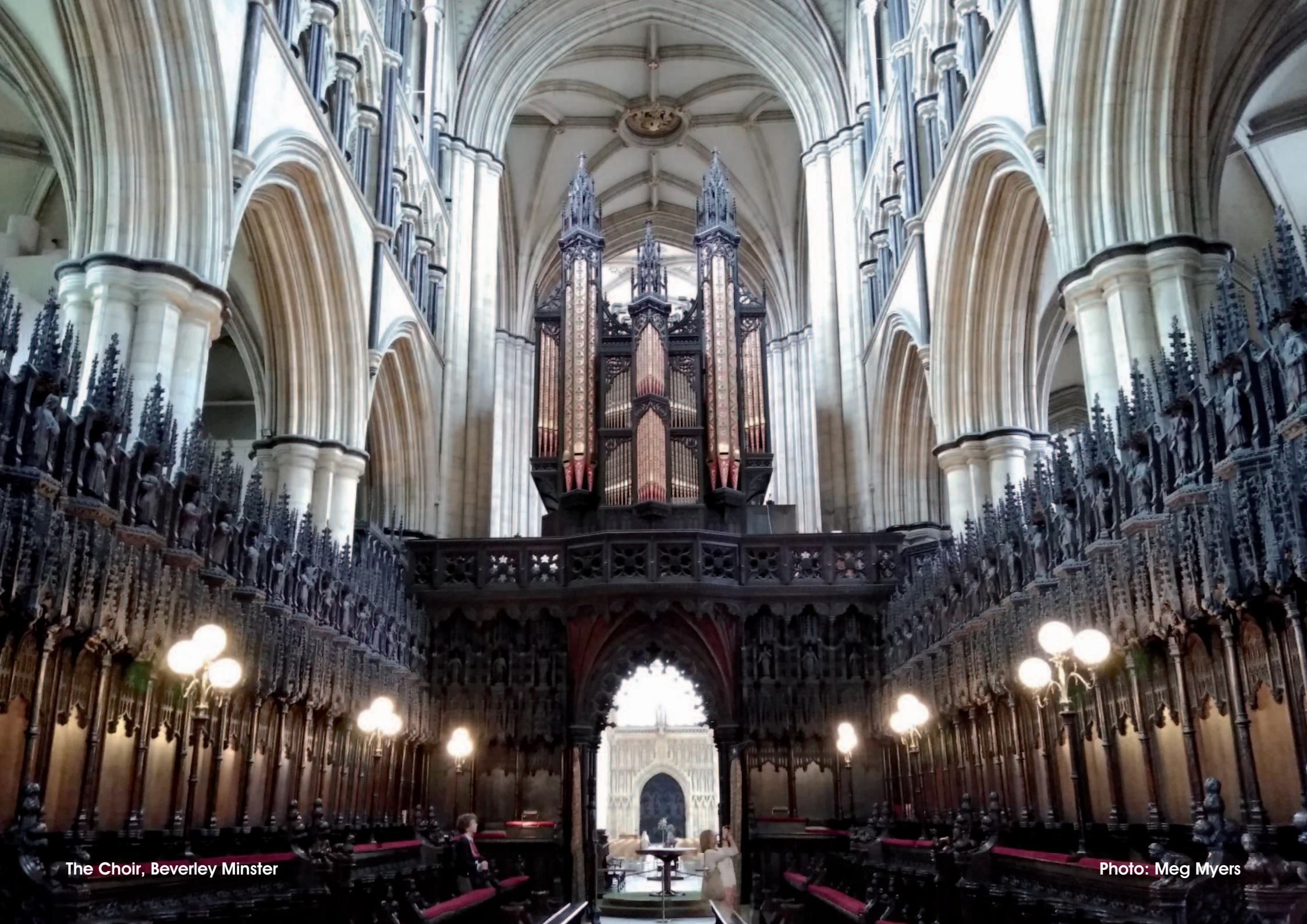
The Choir, Beverley Minster