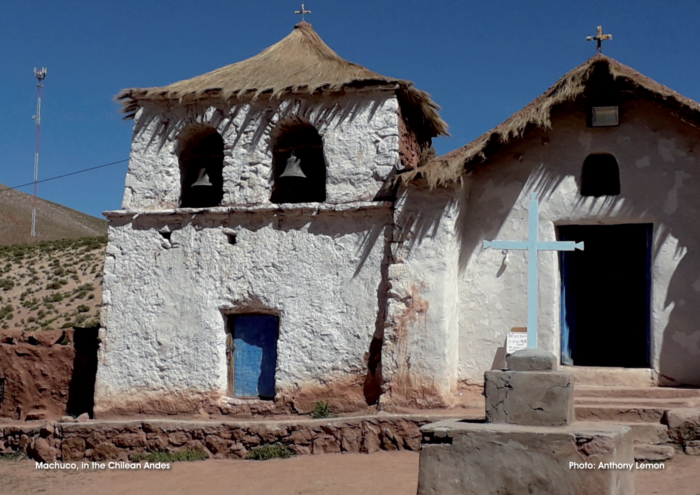
Machuco, in the Chilean Andes