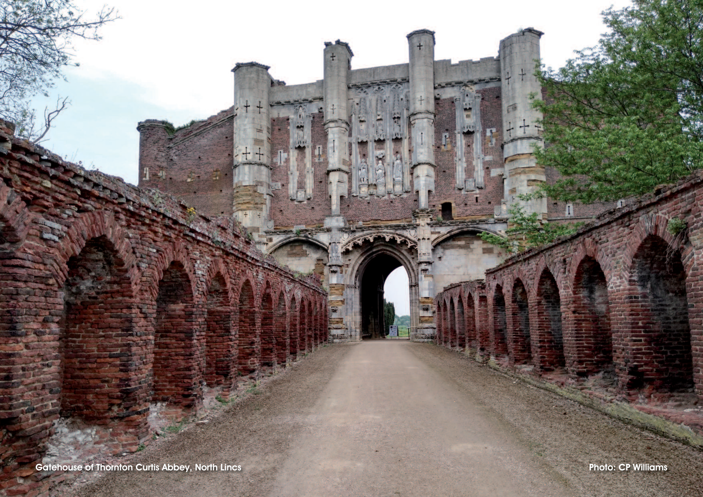
Gatehouse of Thornton Curtis Abbey, North Lincs