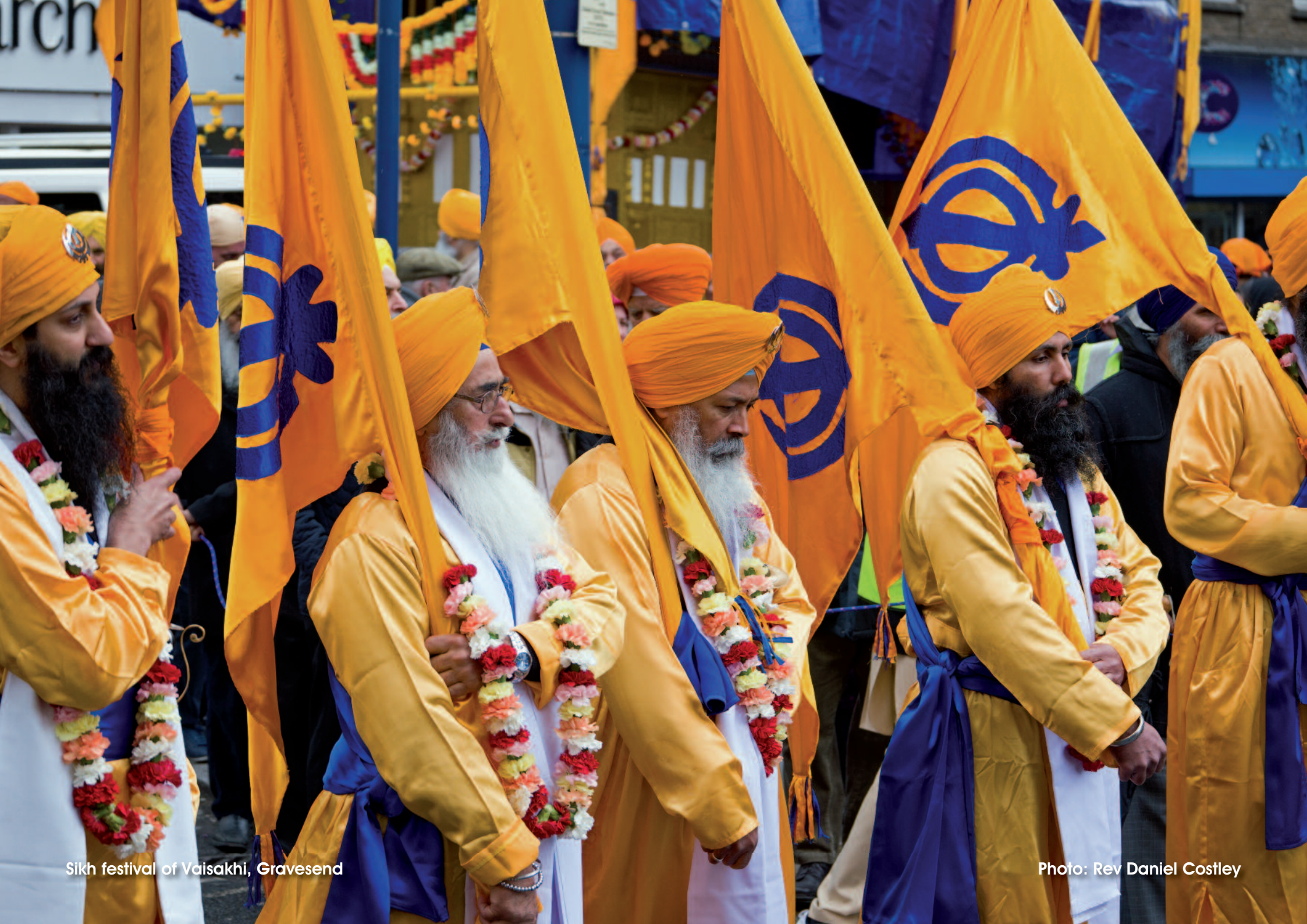
Sikh festival of Vaisakhi, Gravesend