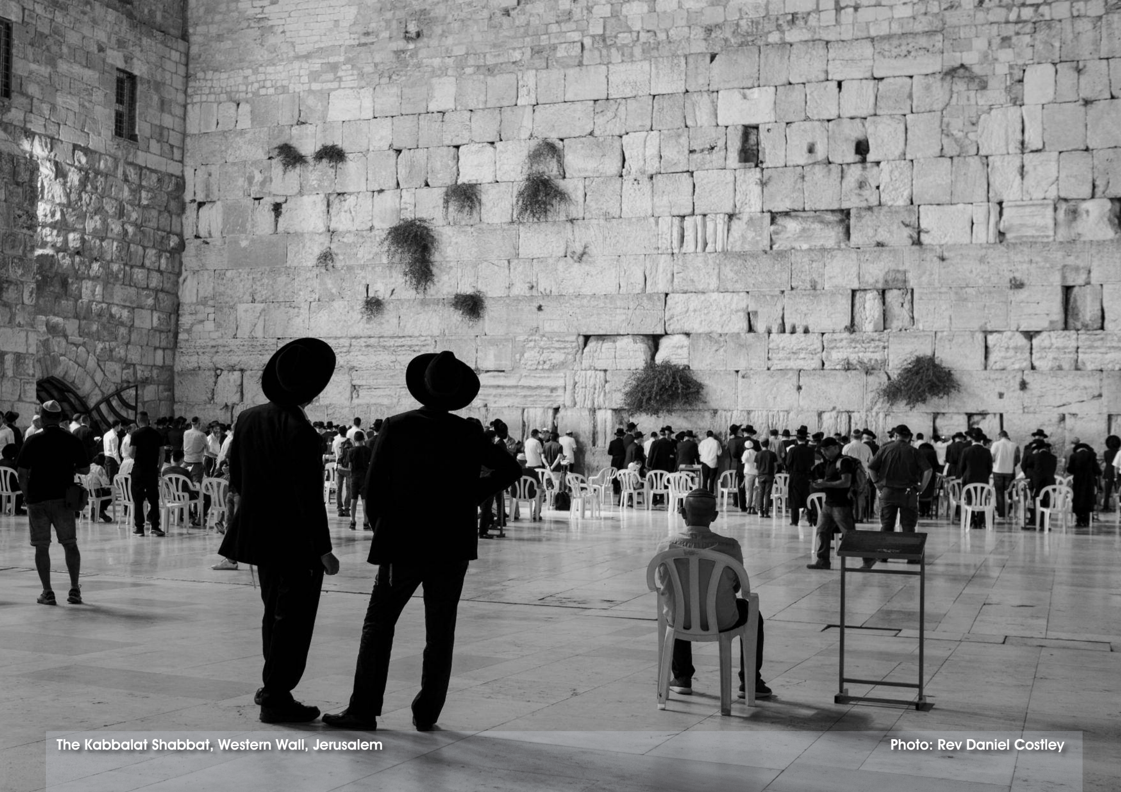
The Kabbalat Shabbat, Western Wall, Jerusalem