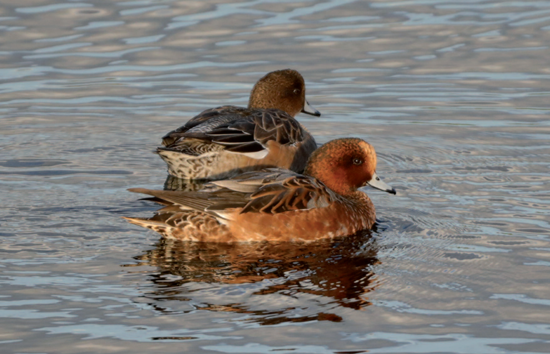
Wigeon (male at front, female at back) on Startops End reservoir, near Tring, Herts