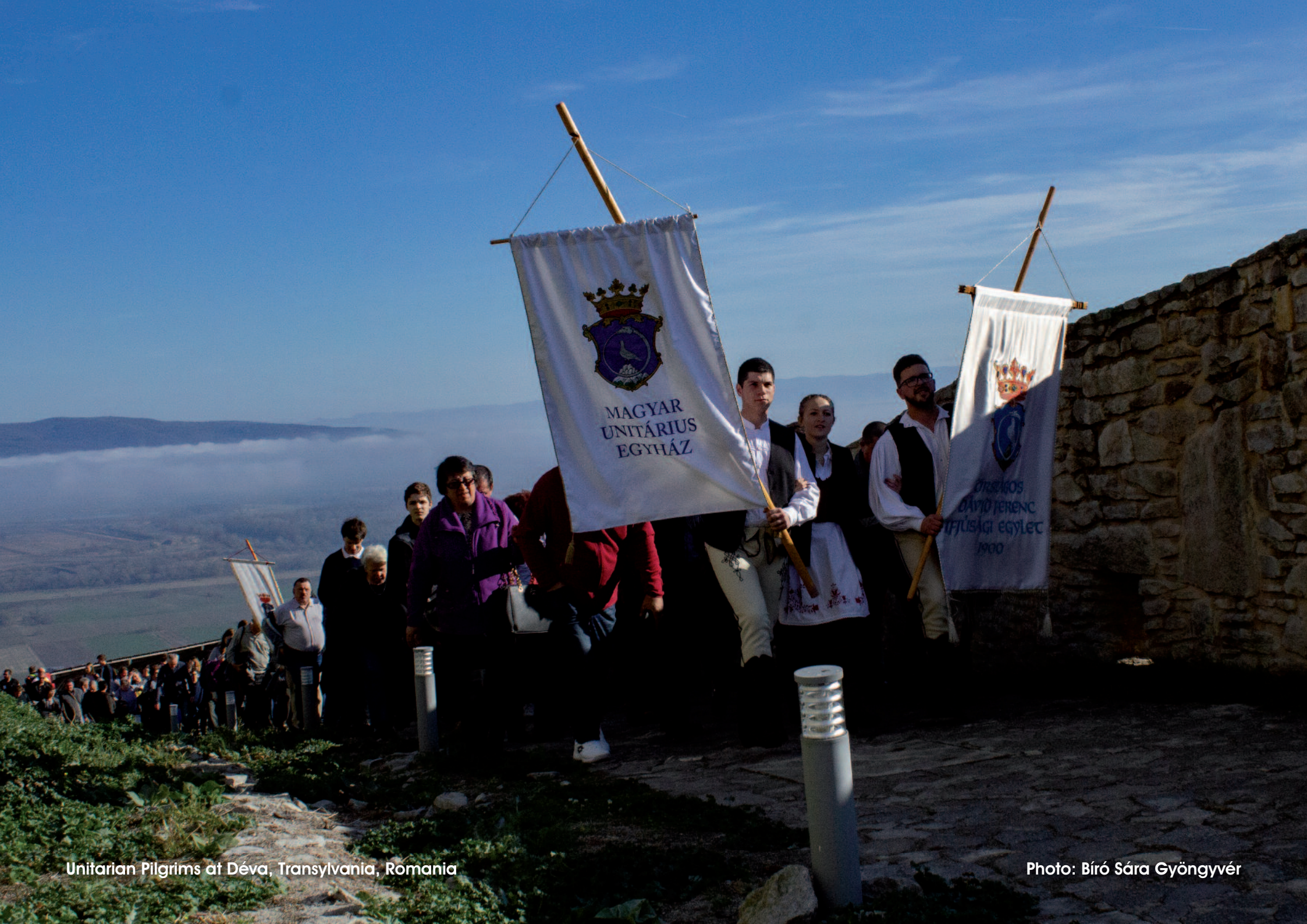
Unitarian Pilgrims at Déva, Transylvania, Romania