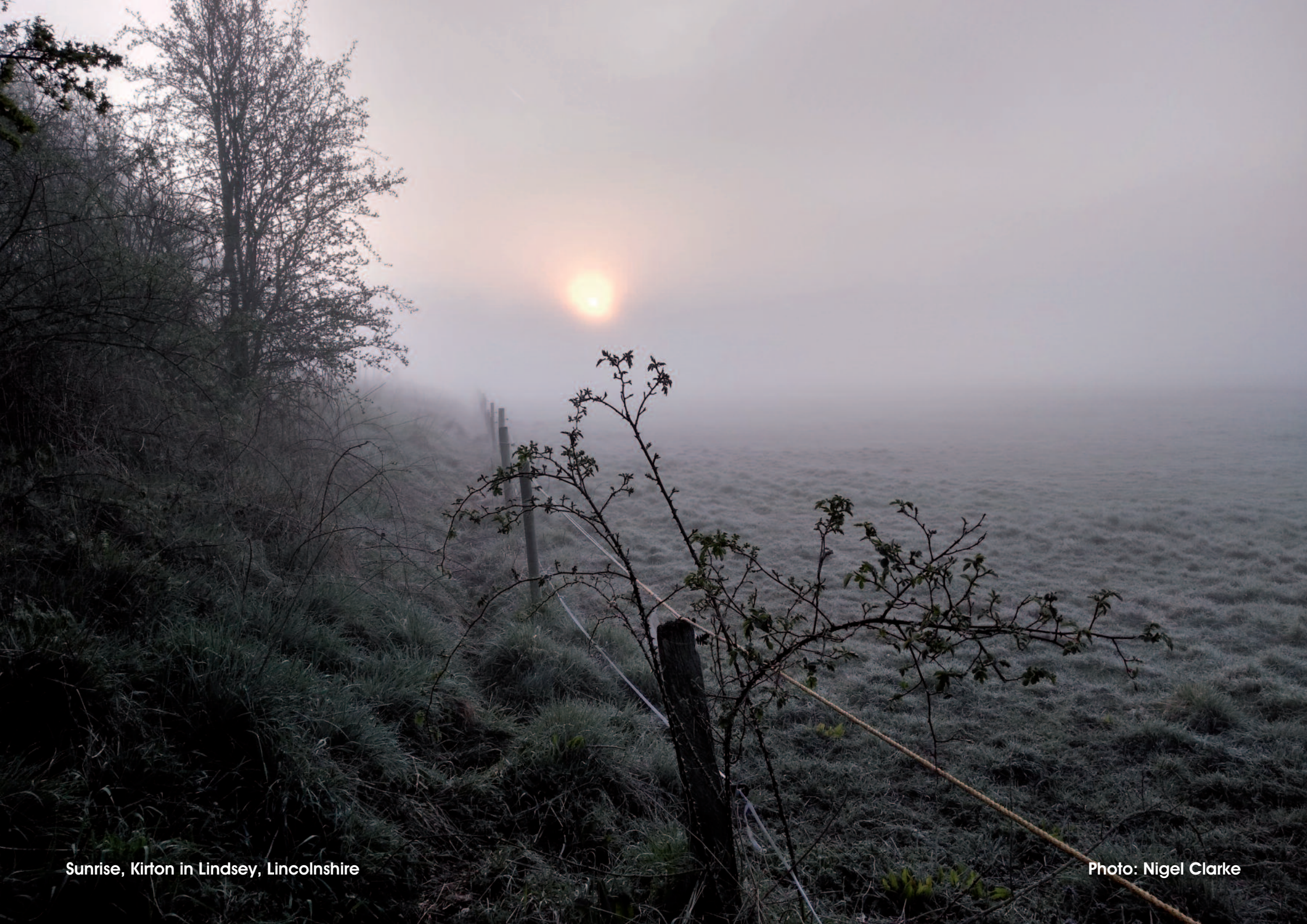
Sunrise, Kirton in Lindsey, Lincolnshire